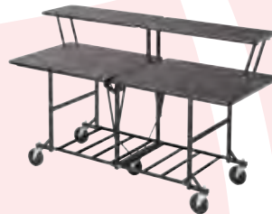
2-Tier Mobile Folding Catering Tables