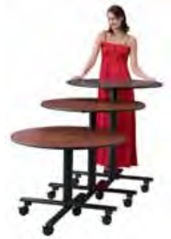
Pre-Function Mobile Folding Tables