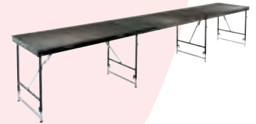
Folding Leg Stages