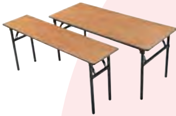
Armor-Edge® Folding Leg Tables