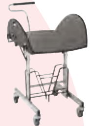
Mobile Folding Room Service Tables