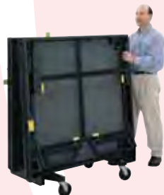
Tri-Height Mobile Folding Stages