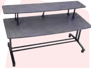
2-Tier Deluxe Mobile Folding Catering Tables