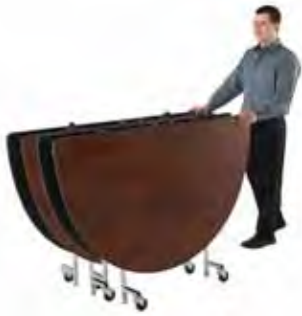
Pacer Mobile Folding Banquet Tables