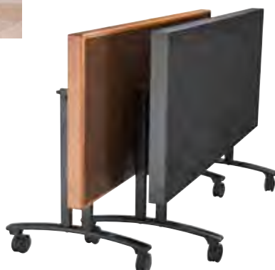
Tables nest for compact storage.