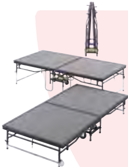
Dual-Height Mobile Folding Stages