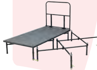
X-Press Folding Stages