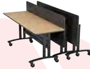
Multiple Application Mobile Folding Tables