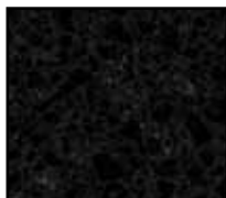
Nero Galaxy (60)