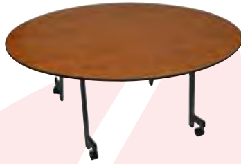
Pacer II Seamless Top Mobile Folding Banquet Tables