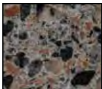
Cristal Rose (61)