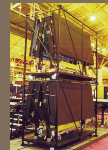
Stacking caddies available