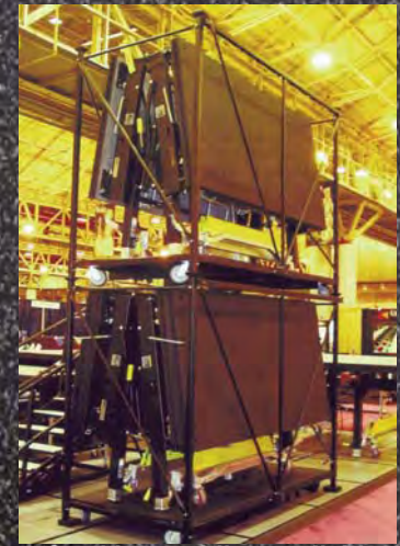
Stacking caddies available