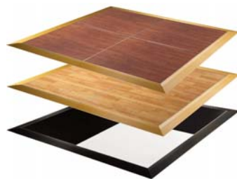
Portable Dance Floors