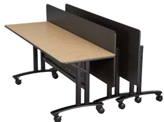
Meeting Room Tables