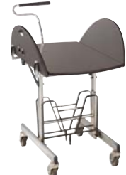
Room Service Tables