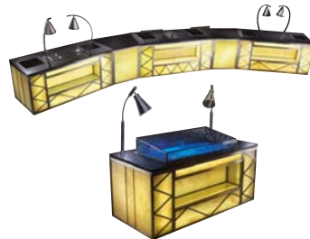
DECO Buffet Systems