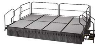
Mobile Folding Stages