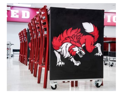
Customizable Incorporate your logo or color scheme to drive school spirit.

SICO<sup>®</sup> Community tables are a natural draw for socializing. Used in common and dining spaces to facilitate conversation and sharing. With options like locking casters or built in power, community tables are a natural draw for everyone.