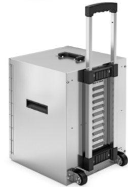
Mobile Solid Fuel