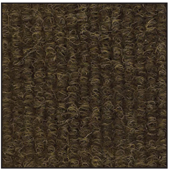
Roasted Almond [46]