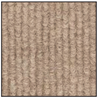
Light Buff [25]