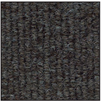
Metallic Blue [43]