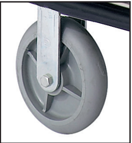
8" (20cm) Zinc Plated Gray Cushion (This option has two locking casters.)