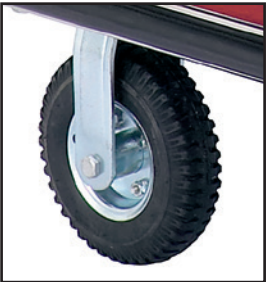
8.5" (22cm) Zinc Plated Pneumatic

8.5" (22cm) pneumatic wheels provide smooth and easy handling. 8" (20cm) gray cushion wheels also available.