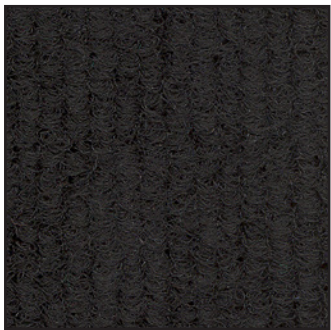
Onyx (Stock Color) [23]