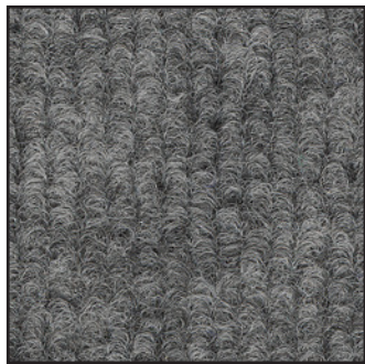
Cloud Gray (Stock Color) [22]