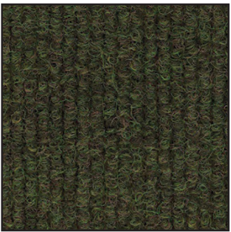
Fern Bank [47]