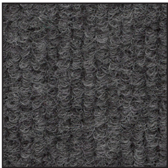
Charcoal (Stock Color) [24]