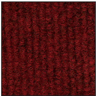
Brick (Stock Color) [38]