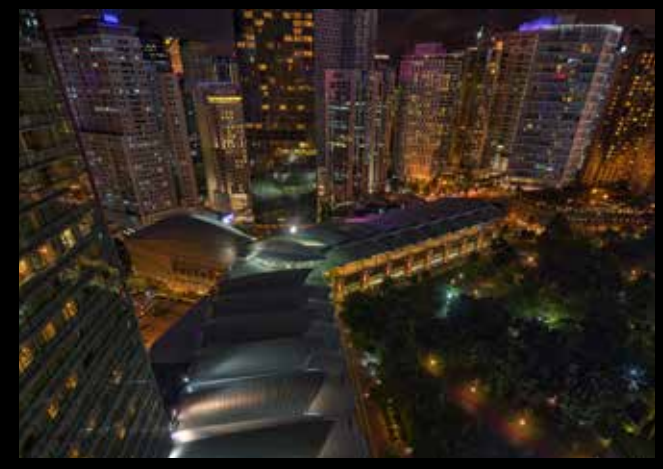
Kuala Lumpur Convention Centre - Malaysia