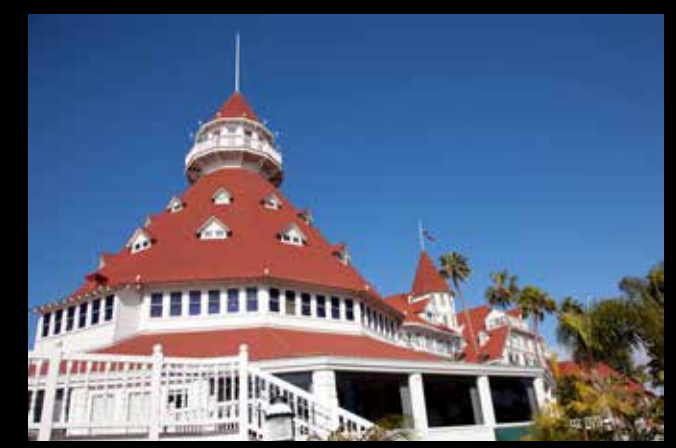
Hotel del Coronado - Coronado