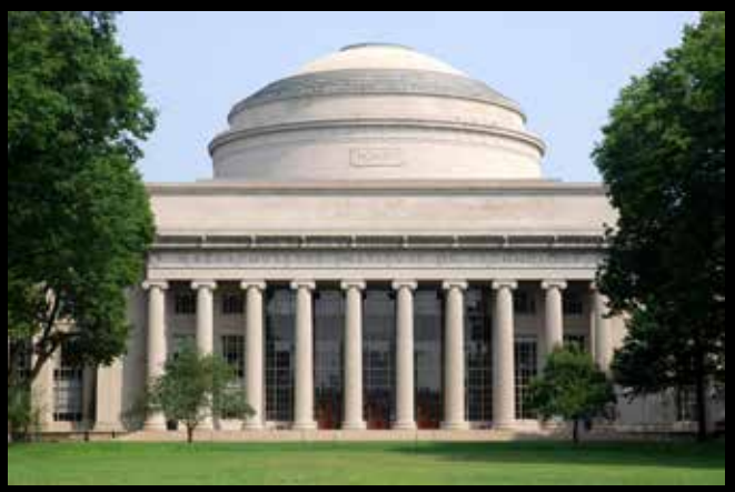
MIT - Cambridge